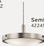
Semi Flush 42245NI